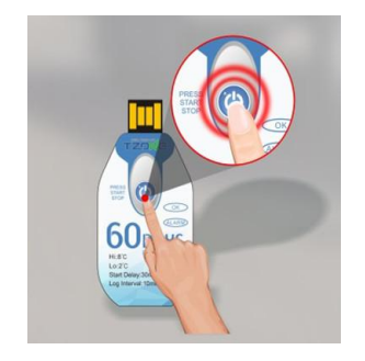
press the button to start